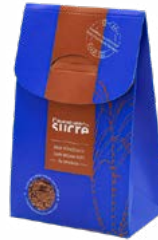
Dark Brown Soft