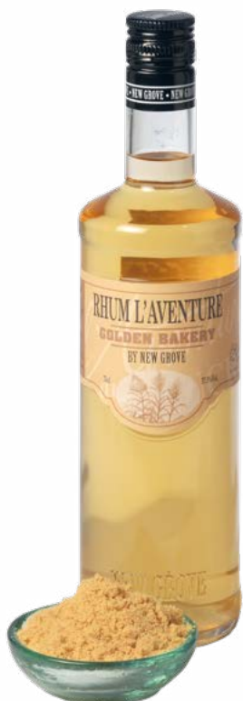
GOLDEN BAKERY 700ml

The House of New Grove, our distillery of 200 years, produces a selection of unique Mauritian raw infused rums. Rum lovers will enjoy round and suave mouthfeel to taste in cocktails, long drinks, on ice, as an aperitif or as a digestive.